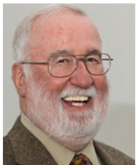
Dr. David Sackett

Dr. David Sackett, Professor Emeritus, McMaster University has been selected as the 2013 CAHS Distinguished Fellow. Dr. Sackett founded the first Department