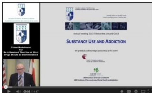
FOR: Be it resolved that use of illicit drugs should be decriminalized...