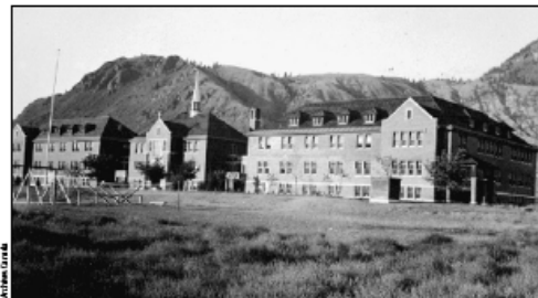
Kamloops Indian Residential School, BC, Canada

Currently, levels of drug use on and off our reserves are of grave concern to our leadership. Many young people in our communities are addicted, suffering in isolation, and still grappling with the legacy of physical and sexual trauma that has been passed down from one generation to the next. This reality is reflected in a recent study by the Cedar Project 9 that monitored rates of infection with HIV and hepatitis C in Aboriginal young people who use drugs in British Columbia. The study revealed links between generations of trauma—such as that suffered by parents and grandparents in residential schools, and the sexual abuse of second-generation and third-generation children and grandchildren early in life—and negative health outcomes, including vulnerability to injection and