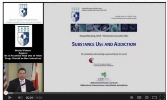
AGAINST: Be it resolved that use of illicit drugs should be decrimin...