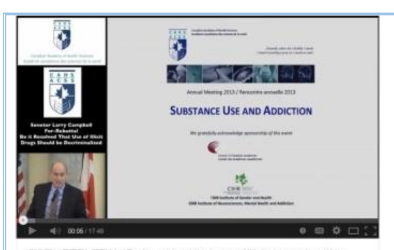
FOR - REBUTTAL: Be it resolved that use of illicit drugs should be ...