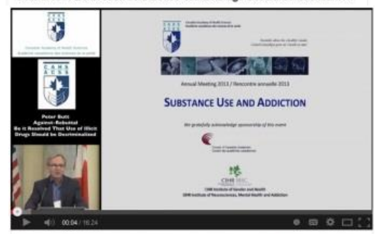
AGAINST - REBUTTAL: Be it resolved that use of illicit drugs shoul...